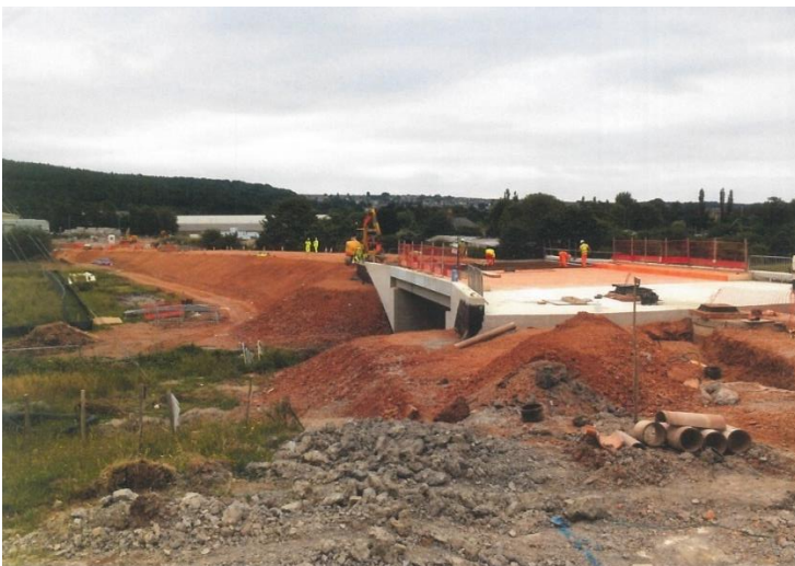
Spine Road crossing