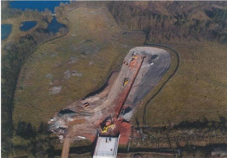
College Plot on left with spine road